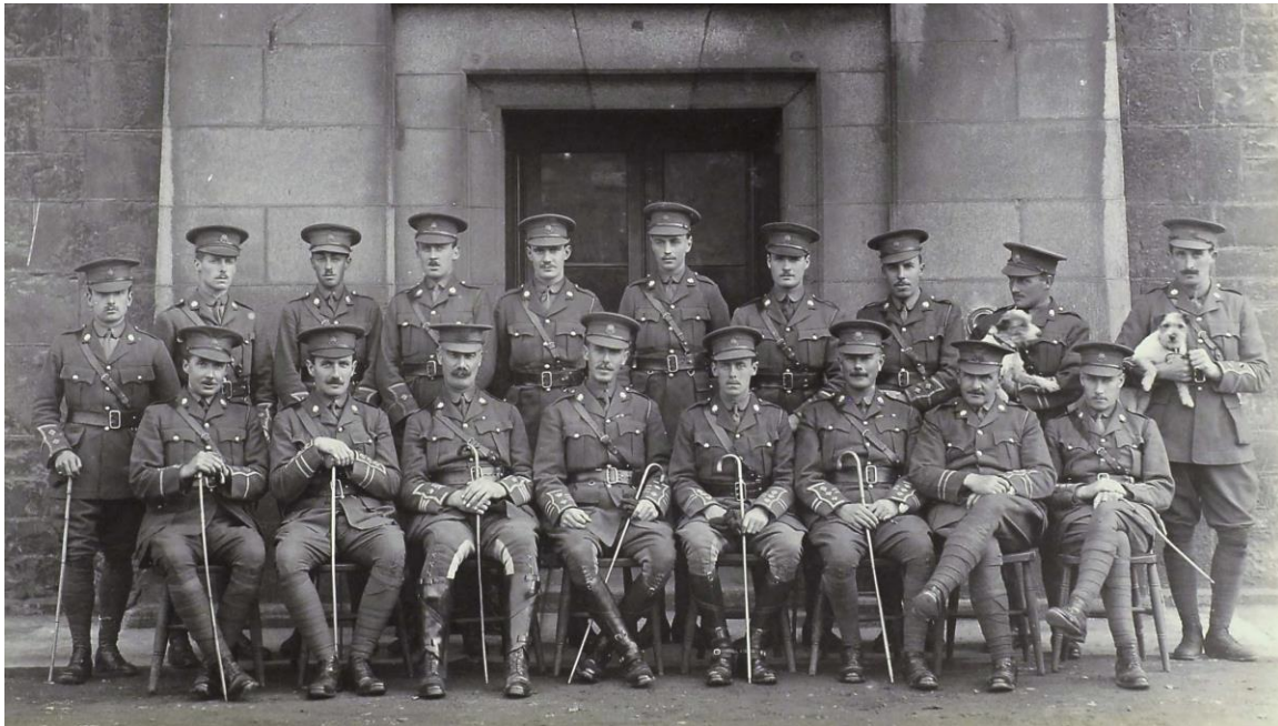
Officers of the East Surrey Regiment

In April I am talking to the Royal St. Georges Society on regimental history then in May we are off to France and Belgium on the FOSIM Battlefield Tour. This starts in Mons where the 1 st Battalion the East Surrey Regiment was soon in action on the canal, after then we follow the retreat south toward Paris to the Marne.